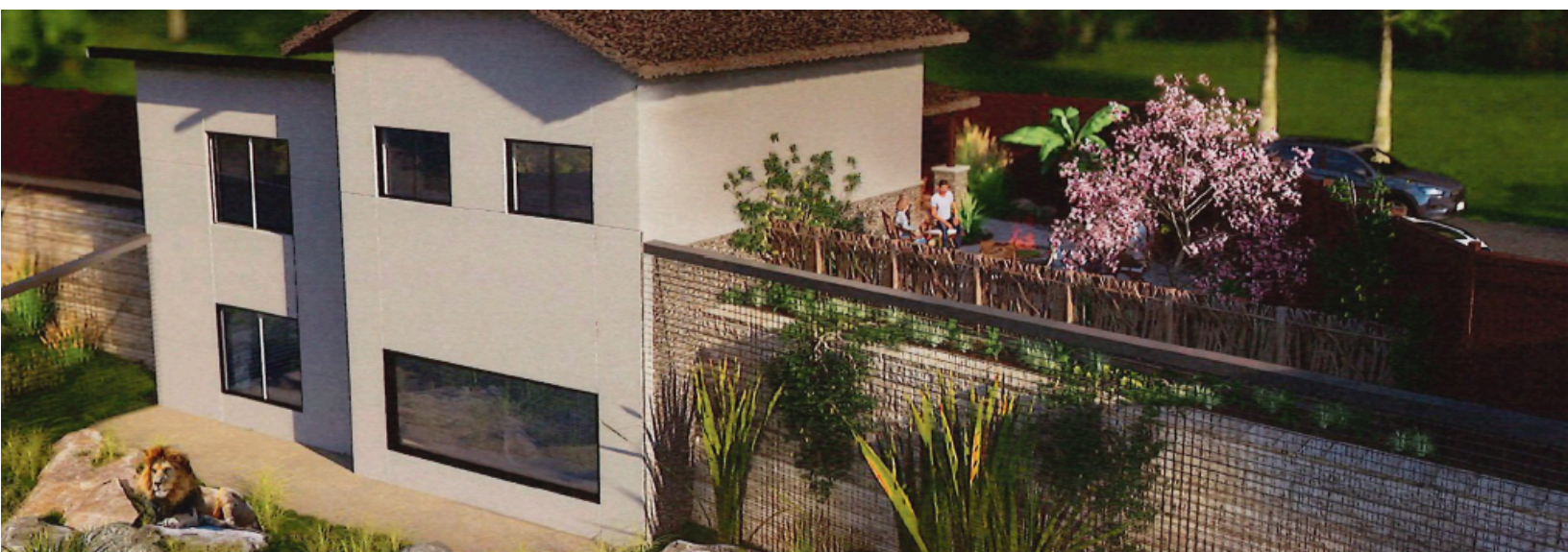
CONCEPTUAL RENDERINGS: GARY E. WEST PRIDELAND VILLAS